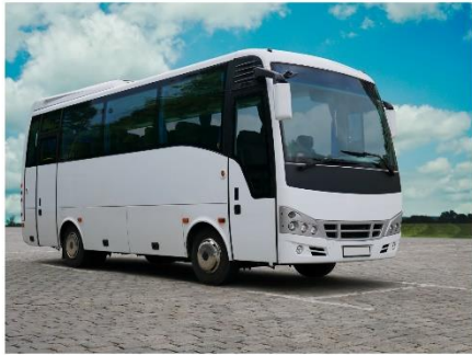
CQA Here We Go!!!

Many of you have likely read your email that gives you the info about the CQA Bus Trip Thursday June 19, 2025. See the info sheet that is also attached to the Newsletter.